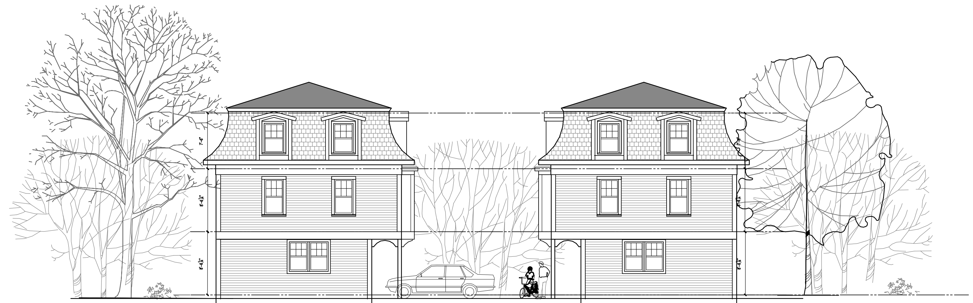
SCHEME #9 – NORTH ELEVATION (FROM CENTRAL STREET)