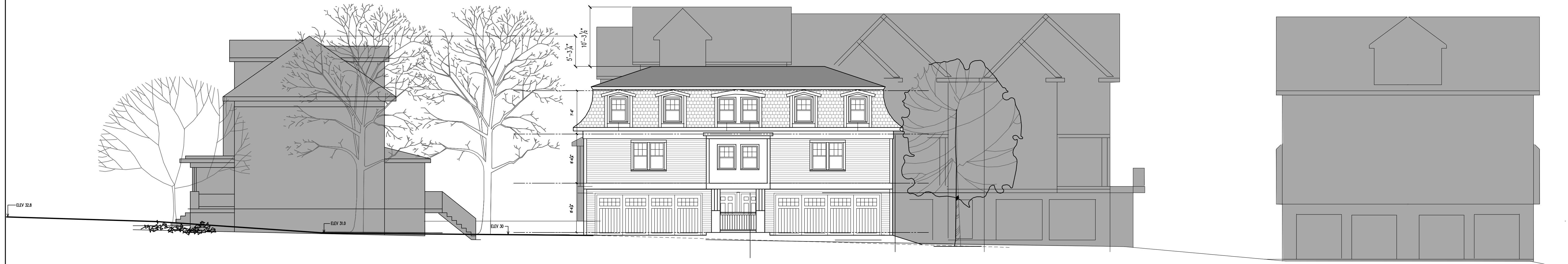
EXISTING HOUSE @ 106 CENTRAL